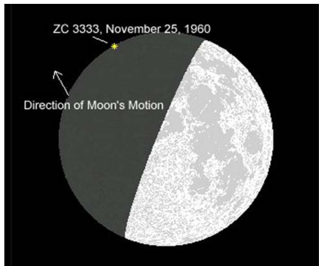
Figure 1. ZC 3333 occulted by the Moon on November 25, 1960 from Terre Haute, Indiana.

Using OCCULT, I computed the occultation event for the night of November 25, 1960. It showed the Moon passing in front of the star at a position angle of 29° and a cusp angle of 51°.