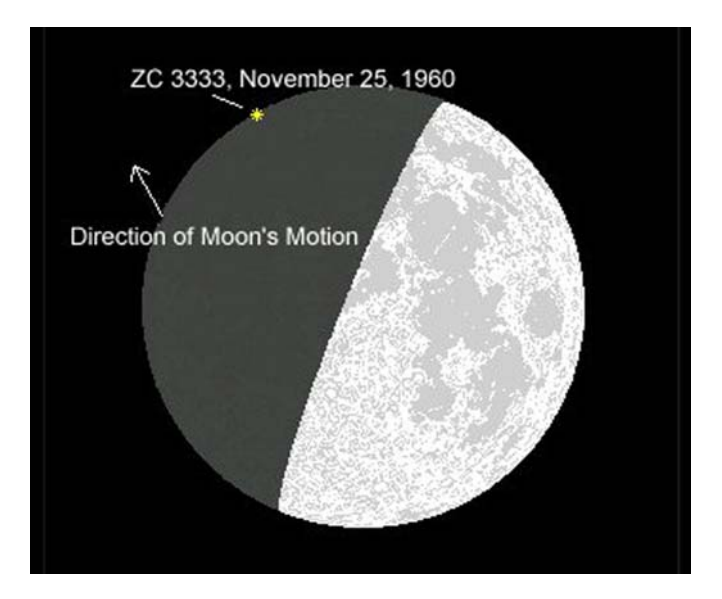
Figure 1. ZC 3333 occulted by the Moon on November 25, 1960 from Terre Haute, Indiana.

Using OCCULT, I computed the occultation event for the night of November 25, 1960. It showed the Moon passing in front of the star at a position angle of 29^{\circ} and a cusp angle of 51^{\circ} .